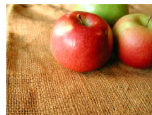
Fig. 1: apple on jute

In the text: Apples (Fig. 1) are nutritious.